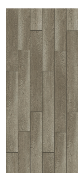
GSP-004 American Chestnut 1219.2mm x 177.8mm