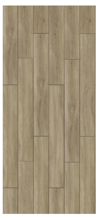
GSP-005 Vintage Oak 1219.2mm x 177.8mm