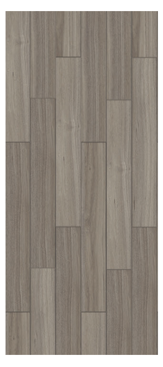
GSP-003 Ash Oak 1219.2mm x 177.8mm