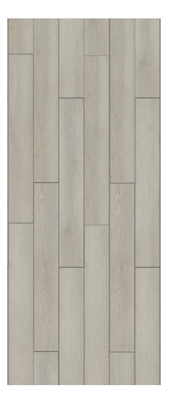
GSP-001 Ivory Oak 1219.2mm x 177.8mm